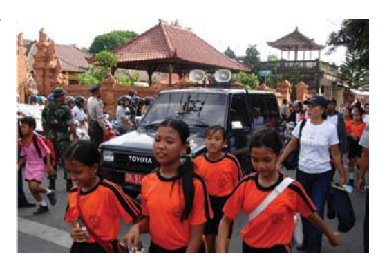
Bali school children follow a designated tsunami evacuation route as part of an Indonesian Tsunami Drill, December 2006

Some 1000 – 2000 school children and teachers were observed participating in the drill. The drill was conducted based on the recommendation of IOC Indonesia Tsunami Roundtable in May 2006. Since then, similar drills have occurred annually on