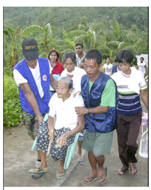
An elderly woman is carried during a pilot Philippine Tsunami Evacuation Drill in a coastal village, May 2006.

The Albay Provincial Disaster Coordinating Council (Albay-PDCC) oversaw evacuations of one pilot barangay (local village).